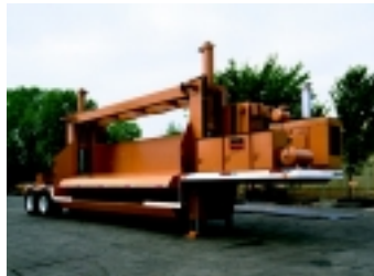
00:10 — Cylinders moving into place