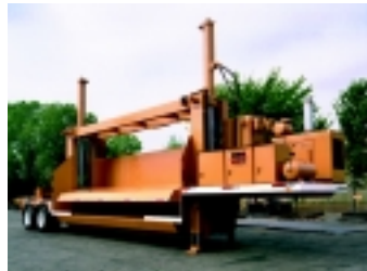
00:27 — QS with cylinders locked