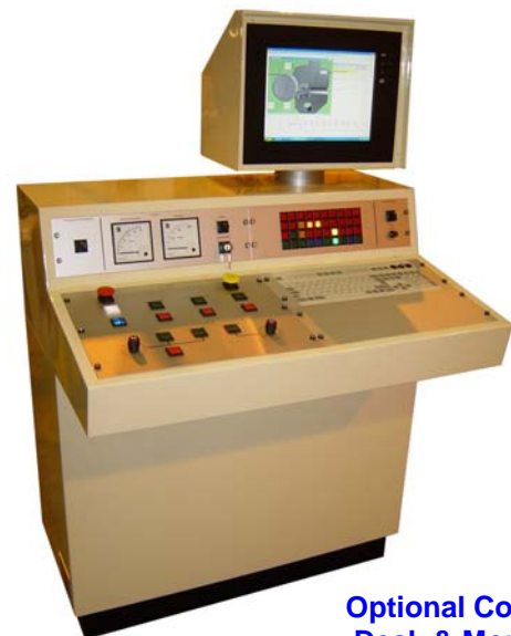
Optional Control Desk & Monitor

Depending on the application and customer preference, BWE's established CDS software (Conform Data System – please refer to separate Technical Bulletin) for line monitoring, data logging and tabular / graphical displays, can be purchased and connected via a high-speed Ethernet interface to the customer's PC. BWE offer the same as an option within a purpose built Control Desk complete with a protected Flat-Screen Monitor. The latest version of CDS is now fully network compatible making it easy to share production data across a local network.